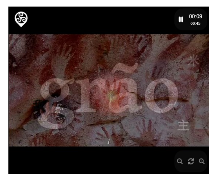
Figure 1. Grão (2012).

Resulting from a prolonged research in dictionaries and texts of linguistics, etymology and mythology, Grain proposes to recreate the world through the word. Its poems experiment the evolution of James Joyce's verbivocovisual to the possible interanimaverbivocovisual in a digital publication.